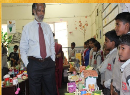
SUSTAINABILITY AT HRS, CLASSES:I TO V TRASH TO TREASURE: CRAFT EXHIBITION