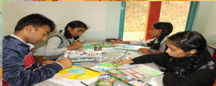
SUSTAINABILITY AT HRS, CLASSES:VI TO XII ART COMPETITION: BIODIVERSITY MAKES OUR PLANET BOUNTIFUL

"Every artist dips his brush in his ownsoul, and paints his own nature into his pictures."