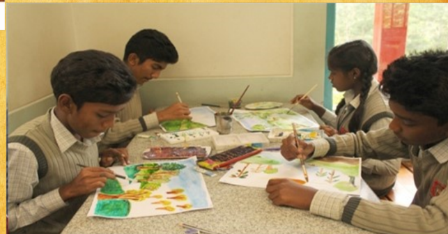
SUSTAINABILITY AT HRS, CLASSES:VI TO XII ART COMPETITION: BIODIVERSITY MAKES OUR PLANET BOUNTIFUL

"To catch the reader's attention, place an interesting sentence or quote from the story here."